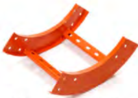
Vertical Outer Bend

We offer high strength ladder type cable trays that are perfect for heavy-duty power distribution in industries. Our ladder cable trays are available in the following specifications